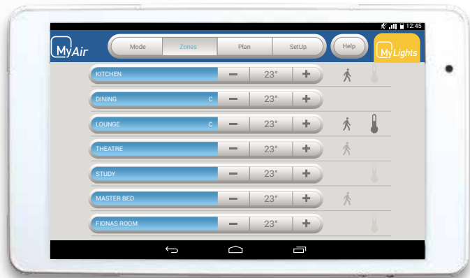
One touch takes you to the zone controls, where you decide how much air goes where.

Like all the best tablets, MyAir Series 5's touch screen is simple and intuitive to use. The entire system is designed to be technophobe-friendly. The home screen displays all your options - simply tap on what you want to do and follow the prompts. For example, when you tap on Zones every room in the house will be displayed. You can then increase or decrease the airflow to any room by tapping the + or - button next to it. Rooms with optional Individual Temperature Control sensors will display temperature while others display airflow %. We've even included a Help button in the unlikely event you need it.